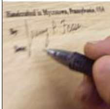
The Personal Touch Craftsmen sign and date their work.