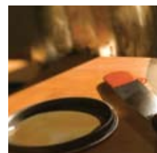
Custom Colors & Matches We'll work with you to match whatever color your customer wants.

Endless Possibilities. Each piece of furniture is built to order, made to your customer's exact specifications. The style, wood species, size, shape, finish, hardware, upholstery – all in all, millions of different combinations are possible. Imagine how delighted your customers will be when they discover that you can deliver that custom table or hutch they've envisioned.