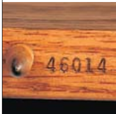
Serial Numbers We keep permanent records of specifications by serial number.