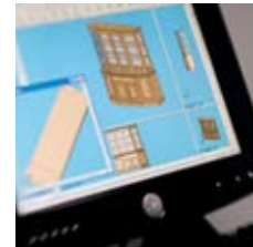
Customization Computer design gives precision to customization.